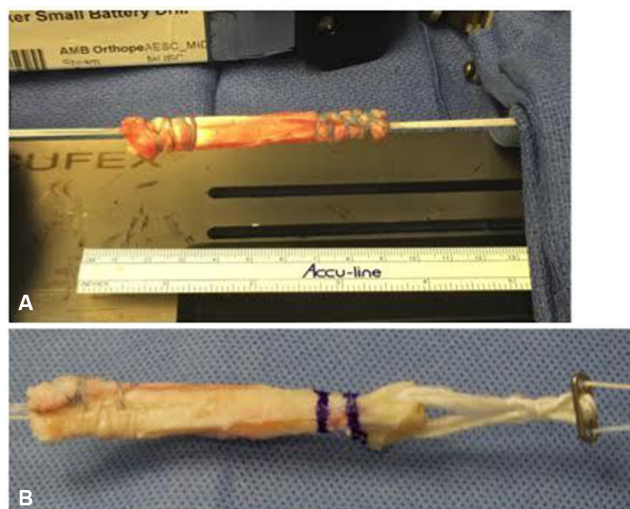
Figure 1 (A) Soft tissue-only quadriceps tendon autograft and (B) quadriceps tendon autograft harvested with a patella bone block.

of sufficient diameter and length to accommodate ligamentous reconstructions.